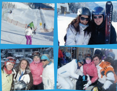
School Trip to Obertsdorf, Germany.